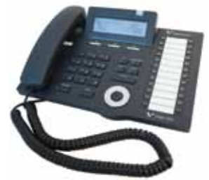
Edge 700 24-Button Phone