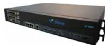
Wave IP 500

Wave IP 500 and Wave IP 2500 rack-mountable "all in one" servers and expansion units stack up well against the competition when it comes to running a leaner, greener organization. Fewer servers mean less overall energy consumption, which translates into even greater operational cost savings.