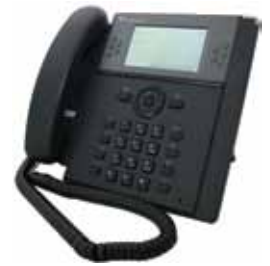
Edge 5000 Executive Phone

While taking full advantage of the advanced feature set and cost savings of Vertical IP endpoints, the true hybrid Wave platform also supports both digital and analog phones to help protect your communications investment.